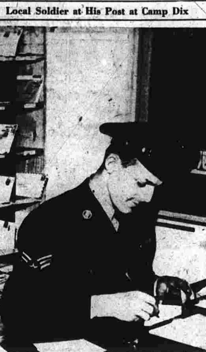
2223rd Overseas Replacement Group (Air Force) Ft. Dix, N. J.

Columbia John Mikolaj, Pine street, met with heavy losses as a result of Saturday's high winds. A modern poultry house which he had built to last two years was completely devastated when its roof blew off and the rear walls were torn off. The big 200 lb. turkey in the poultry house was apparently right in the path of the wind. The turkey was blown into the air and landed in the yard. The turkey was blown into the air and landed in the yard. The turkey was blown into the air and landed in the yard.